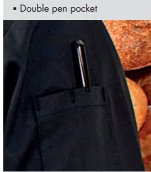
▪ Double pen pocket