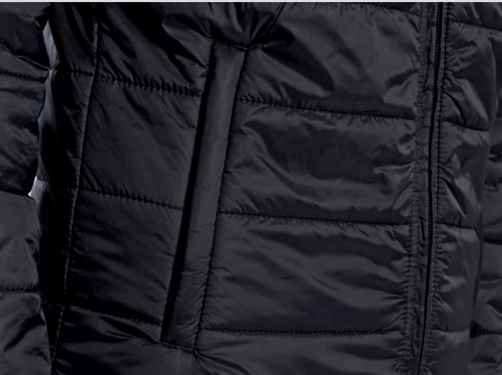
■ Two zipped side pockets