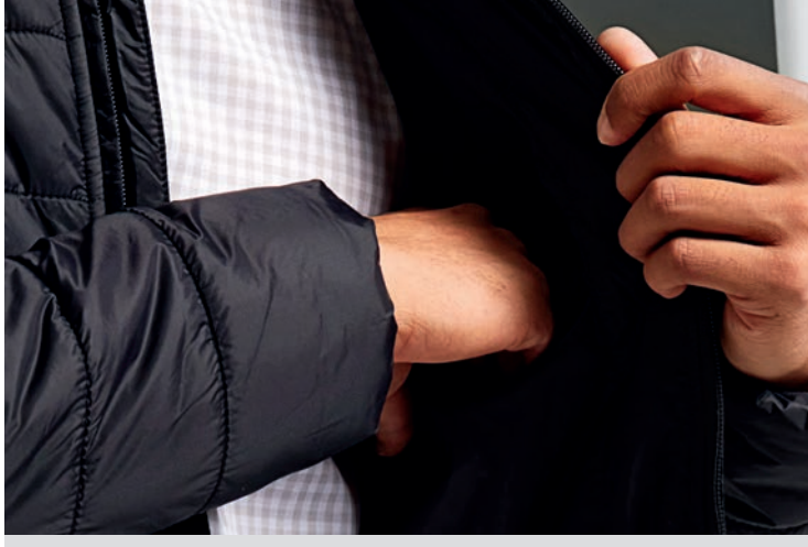
Open pocket to the inner lining