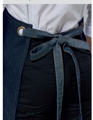
Contrast pocket with rivet detail