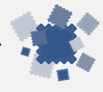
Shredded up and broken down