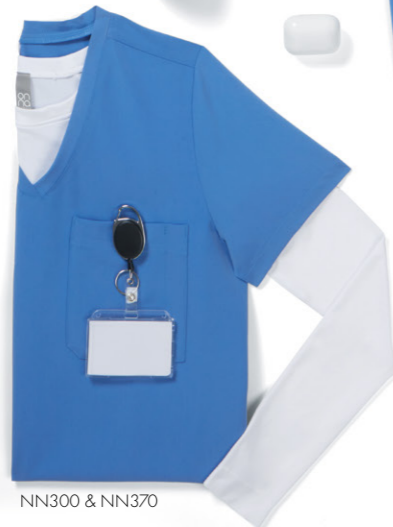
NN300 & NN370