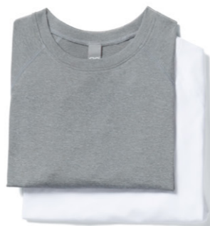
NN270 & NN370