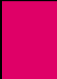
Hot Pink 215C