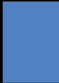
Mid Blue* 2135C