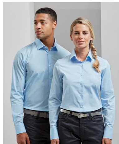
PR244 / PR344 LONG SLEEVE STRETCH FIT POPLIN SHIRT 4 COLOURS