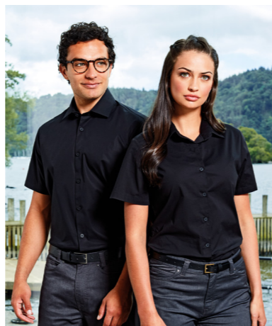
PR246 / PR346 SHORT SLEEVE STRETCH FIT POPLIN SHIRT 4 COLOURS