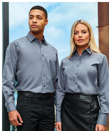
PR200 / PR300 LONG SLEEVE POPLIN SHIRT 27 COLOURS