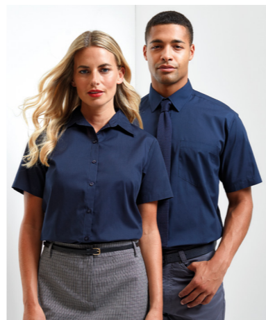
PR202 / PR302 SHORT SLEEVE POPLIN SHIRT 27 COLOURS