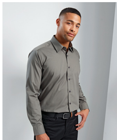
PR204 MEN'S SLIM FIT POPLIN SHIRT 4 COLOURS