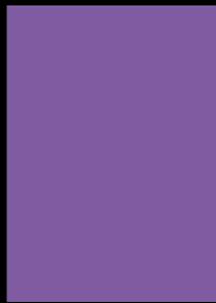
Rich Violet 7677C