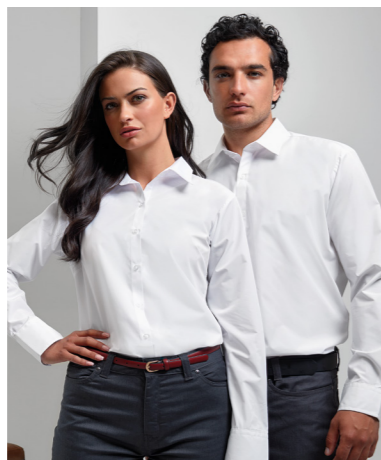
PR207 / PR307 LONG SLEEVE SUPREME POPLIN SHIRT 3 COLOURS